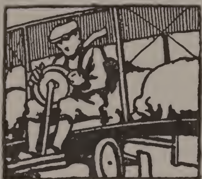
Off In the Air They Went.

S TRANGELY enough, daddy had never told the children a story about an airship, and certainly, he said to himself, another story must not be told about anything before he told an aeroplane story.